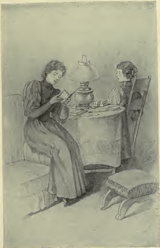
“ SHE OPENED THE BOOK AND READ ”